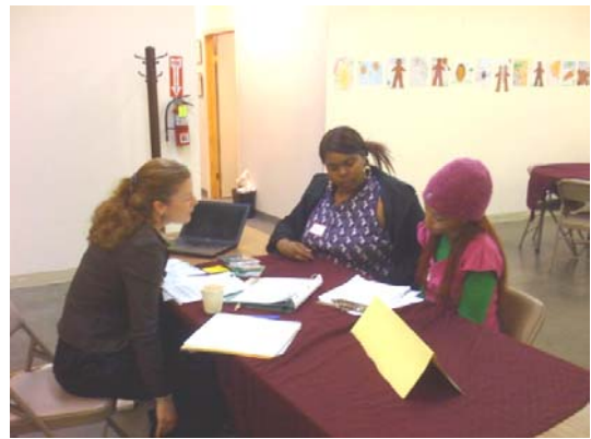
Oakland Children's Hospital

A: Our important partner is the community. We train community members to be healthy and go out and offer outreach to other community members.