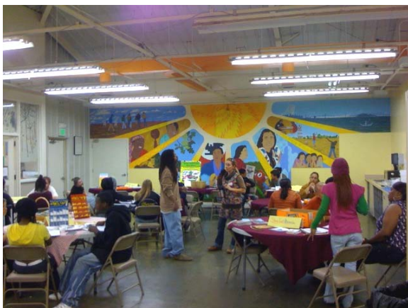
The Youth Advocacy Network Event

At the Youth Advocacy Network Event, GYP participants conducted in depth interviews with the non profit groups. Working in pairs, primed with a series of challenging questions, the youth spent a number of hours engaged in an open dialogue with the representatives. The youth received high praise from the organizations.