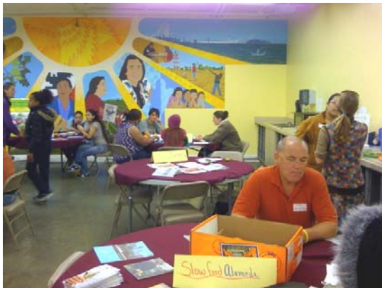
Slow Food Alameda

A: It started as a response to fast food in Italy, with two guys who saw McDonalds and decided to create a slow food movement. Now 60,000 people in the Italy and 100,000 of people in the US are Slow Food advocates.