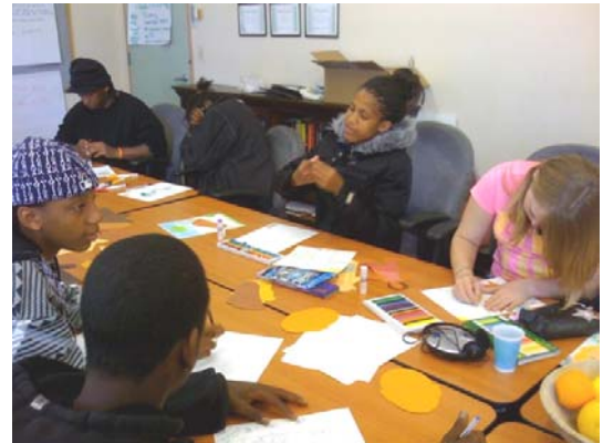
In preparation for the Youth Advocacy Network Event, GYP attended an advocacy training session.

These organizations offered valuable advocacy resources and enabled the Growing Youth Project (GYP) participants to learn more about key issues affecting non profit services and healthy choices.