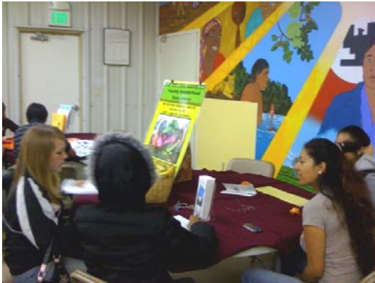
WYSE (West Oakland Youth Standing Empowered)

A: They need to know that they are the ones with the power - we have to let them know that they can have a voice to speak about change in their community. We welcome any youth who want to speak out about good eating, clean food, health choices.